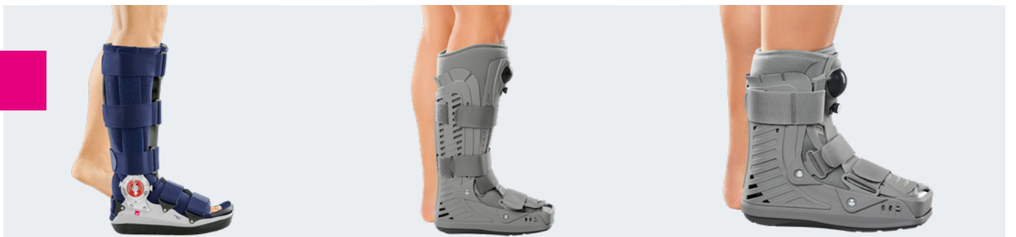
medi® ROM Walker

Lower-leg foot brace for mobilisation with an adjustable range of motion. 1