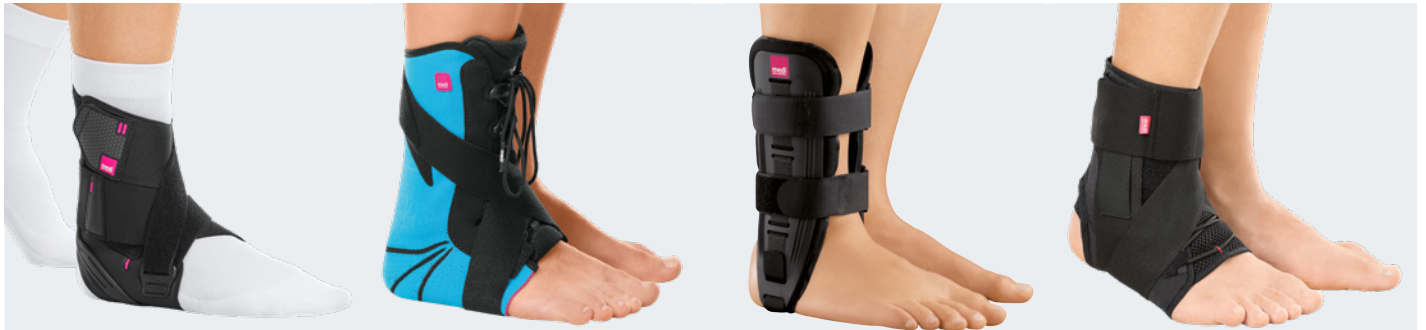
medi® Ankle RTS®

Adjustable ankle brace for stabilisation in one plane. 1